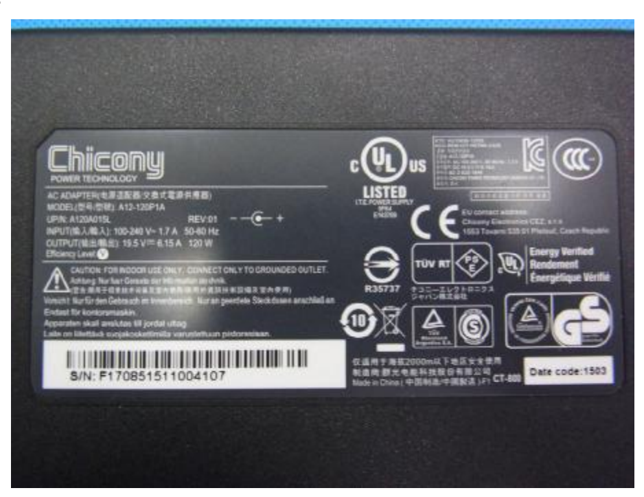
*** ENDS OF REPORT ***